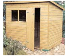
Super Pent Model PB, 8'x5' Shiplap

Do you want an Apex (Double pitched) roof or Pent (single span) roof, How tall are you, will you be spending more than 5 minutes a day in there? Do you need standard felt or the longer lasting Heavy duty version?