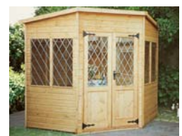
7'X7' Corner shed, Shiplap with leaded windows

The fittings, fixings & nailing should be well coated to protect against rust. Chipboard, OSB board, particle board & Sterling board should never be used. These materials are really not suitable for outdoor use. As a minimum the walls and floor of any building should receive a full immersion in a high grade timber treatment. This provides total panel protection and ensures that the whole panel is treated against rot, insects, bugs & the weather.