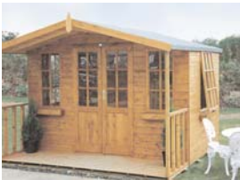
The Chilworth Summerhouse

Shiplap and Loglap finishes should be tongue and grooved not just overlapped. Featheredge Cladding should always have a generous overlap to eliminate warping. It is also worth checking the thickness of the timber cladding. Too thin and the building will soon be showing signs of wear.