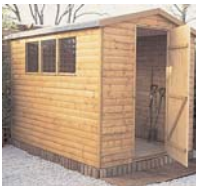
Super Apex Model AI, 8'x6' Loglap

As with all things low price often mean low quality & short life. Some of the cheapest prices come from the internet, catalogues or superstores. Their life expectancy is usually 1-3 years things to consider here are; time & labour spent replacing a shed always costs more than paying a small premium at the start for quality workmanship and materials even before you add in the risk of damage caused by poor construction to the contents of your garden building. The old adage "do it right first time" bodes well. Buying from a catalogue or internet can be risky especially when you cannot view the actual product. A picture may be worth "a thousand words", but it is a poor substitute for actually standing inside a shed. Costs can vary from £300 right up to £3000. So a small amount of research & a visit to a dealer can make your decision a far easier and less worrying process.