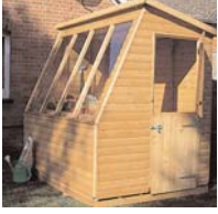
Solar potting shed

A small amount of planning at the beginning ensures you get what you want, not what the salesman wants to sell you. Questions such as, what size building do you want? Where will it go? Is there a suitable base? How many windows do you want? And where are they and the door to be located? Will save you a great deal of time & effort in the long term, there can be no substitute for fully researching your needs at this point.